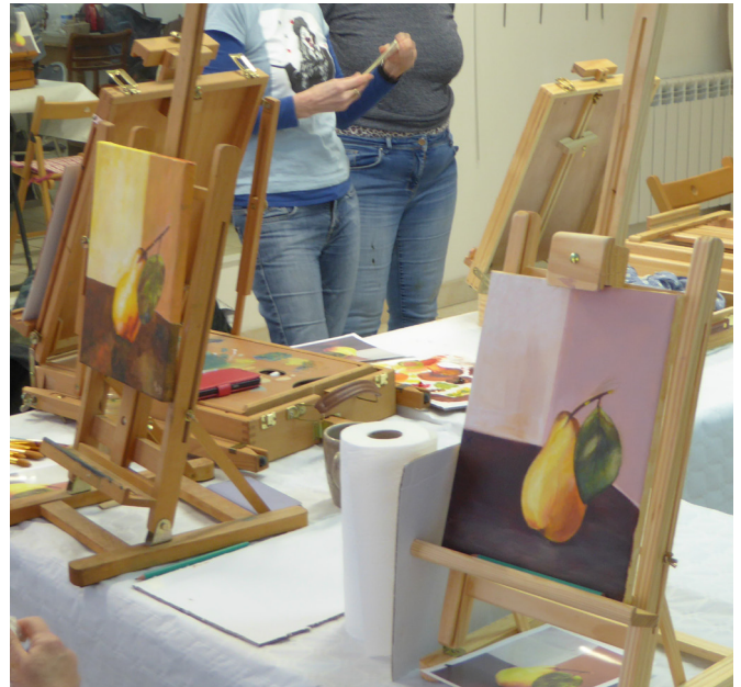
Work in progress - week 1, winter 2019